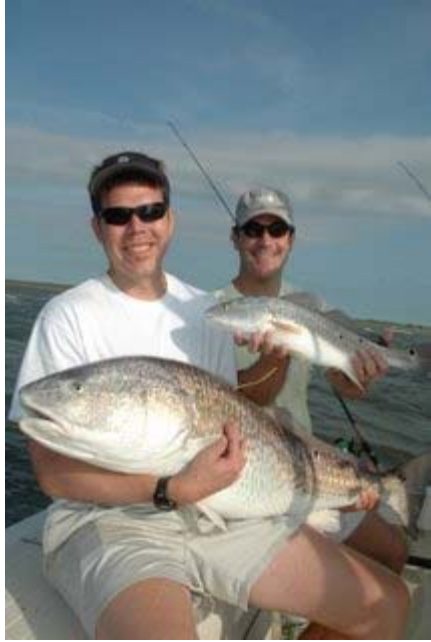
and a two foot trout on a drum rig