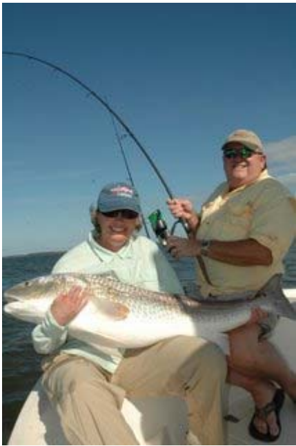
A huge double header, a pair of 52 inchers, two of our biggest this year