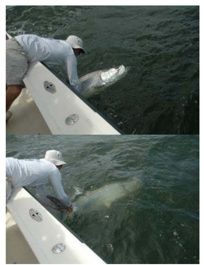
posted by Capt. George Beckwith at 6:46 PM