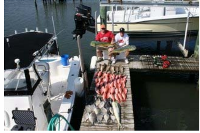
posted by Capt. George Beckwith at 12:05 PM